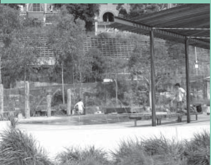
Pirrama Park, Pyrmont

Existing open spaces large and small have been restored including sports grounds and facilities, children's playgrounds and wetlands enhancing birdlife. All work has involved water retention and recycling.