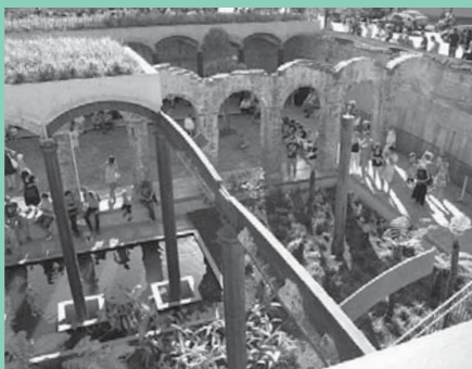
Paddington Reservoir Gardens